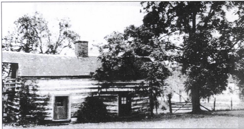
Old Slave Cabin on the Quick Place in Amherst County.