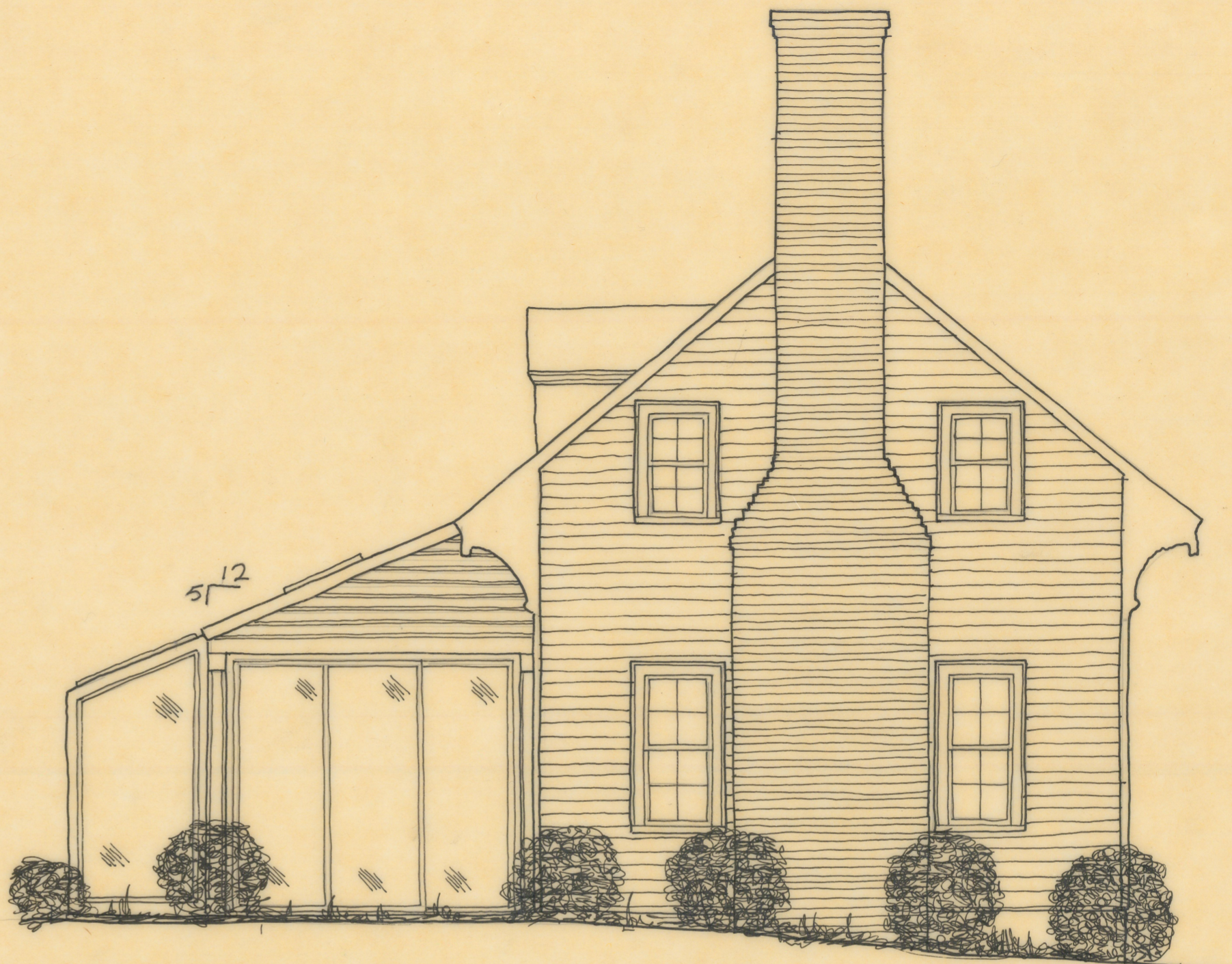
REAR ELEVATION 1/4" = 1'-0"