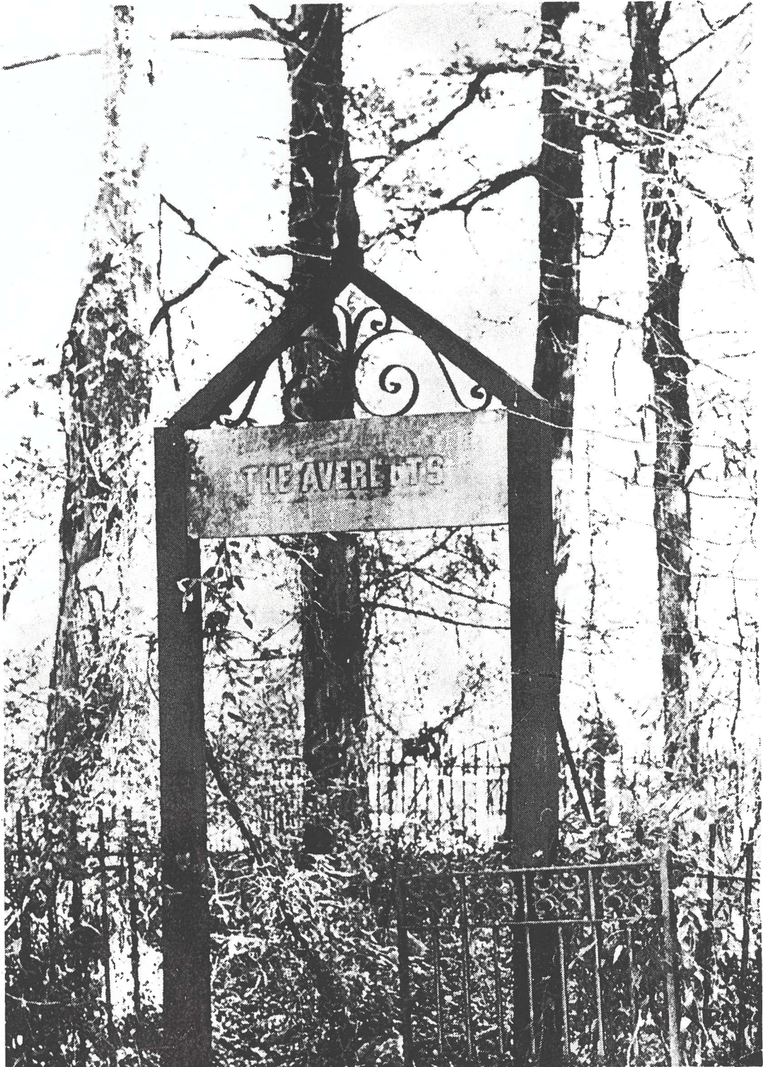
THE AVERETT SQUARE--in the Halifax condition. The marble plaque bearing the